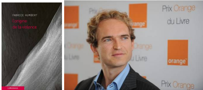
Fabrice Humbert L'origine de la violence (The Origin of Violence), published by Le Passage